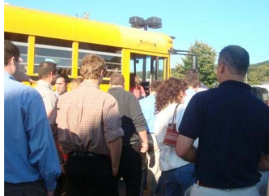
Sikorsky Finance employees board the bus and shop for food at B.J.'s for Spooner House.