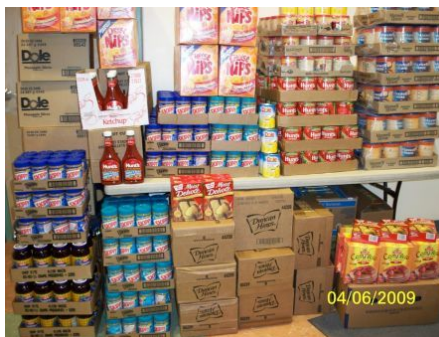
Some of the five tons of food donated by Pitney Bowes employees.

The CVC's Food Drive program goes a long way toward helping to meet the food need in the Valley. It is estimated that 55% of the food donations made to ACT/Spooner House come from CVC companies. Last month, ACT's Food Pantry shelves got a big boost from two large scale food collections by Valley companies. Pitney Bowes employees donated $9,424 to the company's annual "Cash for Food" drive. Utilizing the company's matching gift program and taking advantage of 2-for-1 sales and bulk discounts, the donated funds purchased an amazing $20,174 worth of food – a total of 8,099 items weighing more than five tons! Anne Wege, a director at Pitney Bowes has run the food drive for the past six years.