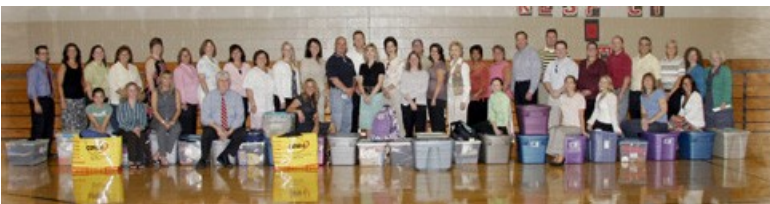
CVC members with "Back-to-School" packages for 180 children at Mead School. For more photos, visit www.valleyunitedway.org .

In the past eleven years the Corporate Volunteer Council has outfitted 1095 Valley children with corporate donations totaling $210,325. The Council is proud to play a vital role in boosting self-esteem and confidence in needy school children by helping them look and feel their best – a proven positive effect on educational performance.